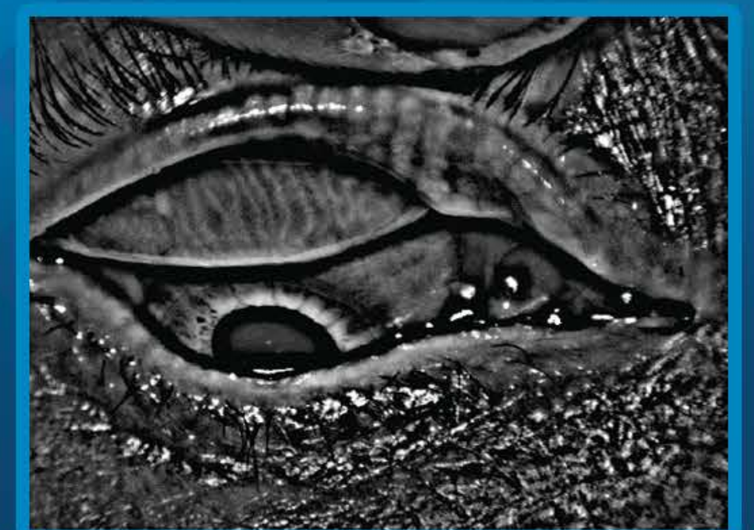
Images taken with Oculus 5M