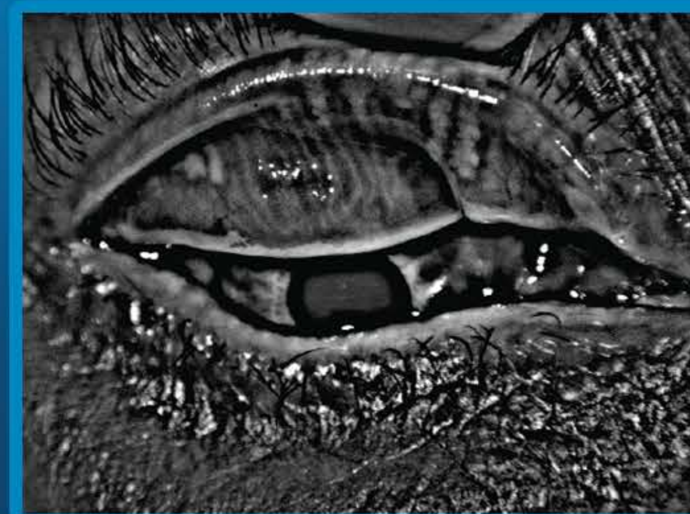
After 12 Minute Treatment